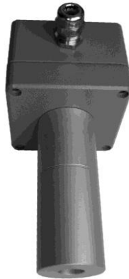
GMF 790 IR