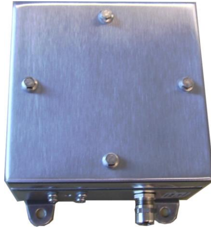
GMF 305 Z O2 VA with stainless steel housing